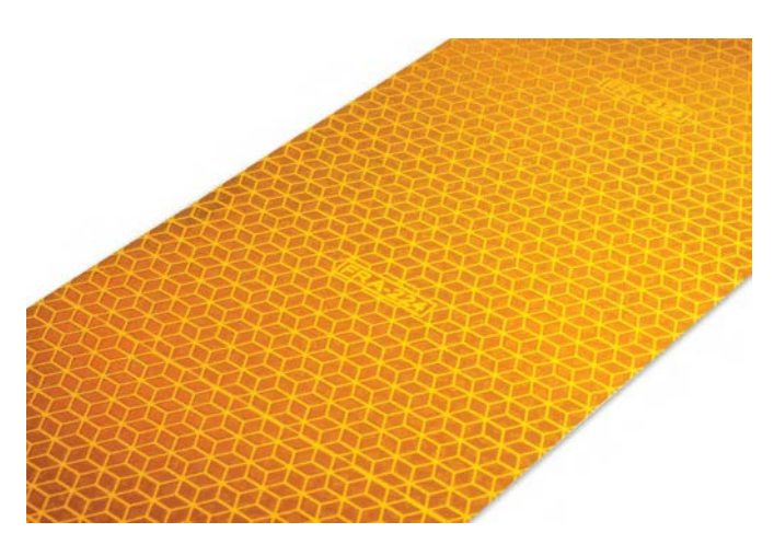
Part Number: R4X150BY